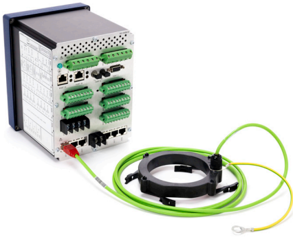
Schweitzer Engineering Laboratories SEL-751