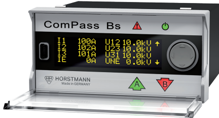
Hortsmann ComPass Bs 2.0