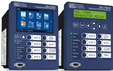
Schweitzer Engineering Laboratories SEL-700G