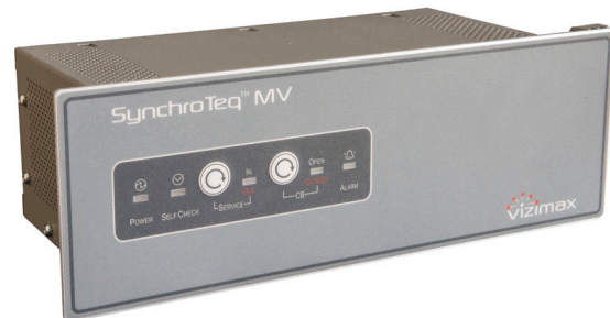
13 Vizimax SynchroTeq® MV

(1) For additional accuracy class improvement, please contact the ABB representative.