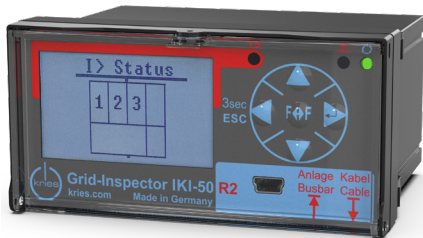
Kries Inspector IKI-50