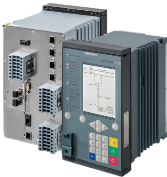
Siemens SIPROTEC 7SY82