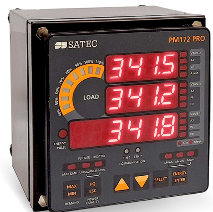
Satec PM 172 PRO