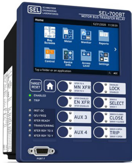
Schweitzer Engineering Laboratories SEL-700BT