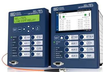
Schweitzer Engineering Laboratories SEL-787L