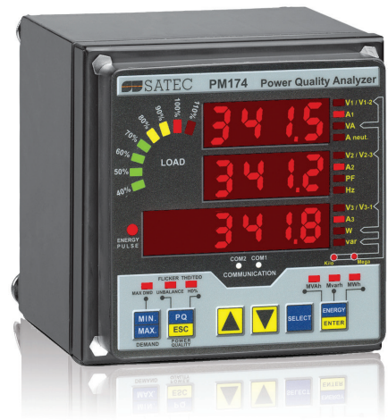
Satec PM 174

* Limitation on the measurement of individual harmonics in current. Maximum measurable harmonic is 21 st for 50 Hz and 18 th for 60 Hz (1050 Hz)