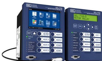
Schweitzer Engineering Laboratories SEL-710-5