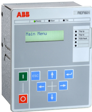
REF601, REJ601, REM601