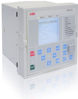
REF615, REM615, RED615, REC615