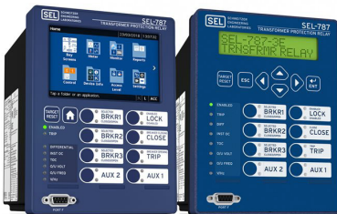
Schweitzer Engineering Laboratories SEL-787-4